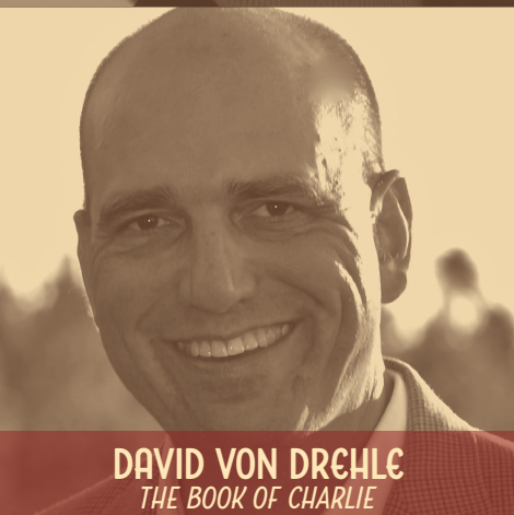
DAVID VON DREHLE THE BOOK OF CHARLIE