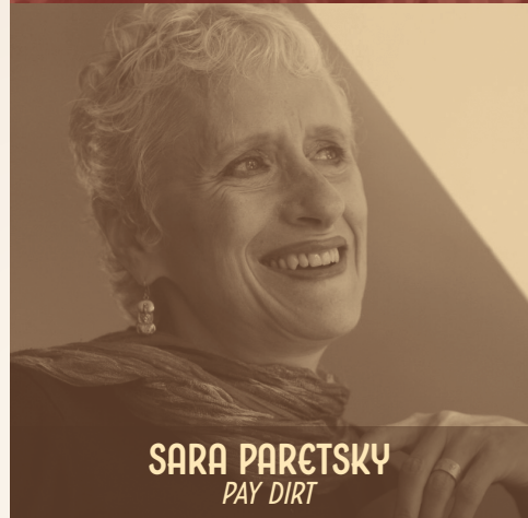
SARA PARETSKY PAY DIRT